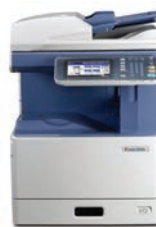
e-STUDIO2050c Base Model